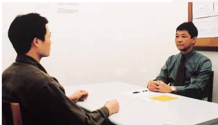
投訴調查組人員在荔枝角收押所會晤在囚人士。 An officer of the Complaints Investigation Unit interviews an inmate at the Lai Chi Kok Reception Centre.

其他公共機構，包括立法會、政府總部、申訴專員公署及區議會等轉介的個案，只要屬於投訴調查組的職權範圍，該組亦會處理。