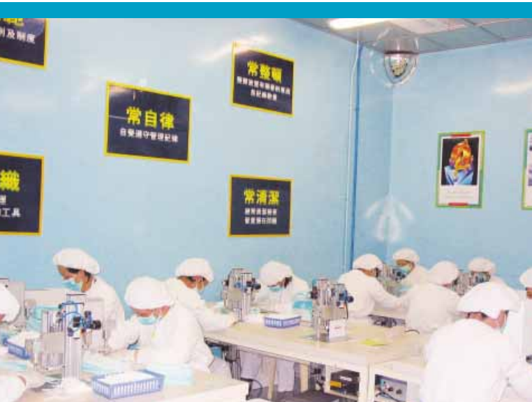
芝新惩教所在囚人士正制造过滤面罩。 Prisoners manufacturing filter masks at Chi Sun Correctional Institution.

根据二零零四年制订的「三用」策略（物尽其用、废物利用及循环再用），更多环保措施已融入日常工作和程序中。部分已发展和落实的例子包括产品包装精简化、减少物料消耗和浪费、采用循环再造物料和改良洗熨工作方法及程序等。